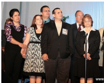
Our district's AGWM missionaries at District Council